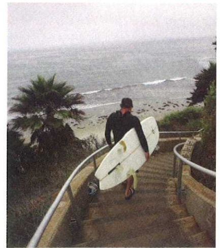
Left to right: the San Diego Botanic Garden in Encinitas; the Carlsbad train depot; a surfer heads down the long staircase to reach the surf break at Swami's.

Del Mar, Solana Beach, Encinitas, Carlsbad ... These cities exemplify the good life.